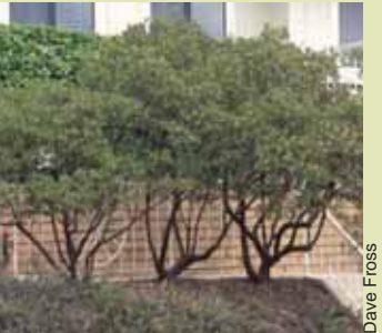
Manzanita ( Arctostaphylos 'Austin Griffiths')

and longer-lived selections include Ceanothus 'Ray Hartman', Ceanothus arboreus 'Cliff Schmidt', and Ceanothus thyrsiflorus 'Snow Flurry'. Manzanitas, Arctostaphylos species, such as Arctostaphylos bakeri 'Louis Edmumds', 'Hood Mountain', and 'Austin Griffiths' could be used in combination to create a striking eight to twelve foot screen, but regular pruning is not recommended.