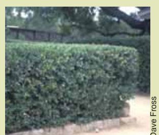
Lemonadeberry (Rhus integrifolia)

All of the above-mentioned choices are appropriate for informal hedges. The columnar or narrow habit and garden tolerance of Pacific wax myrtle, toyon, and mountain mahogany make them suitable for smaller gardens common to urban areas. If the garden soil is even moderately well drained, an additional range of California natives can be considered. Many upright cultivars* in the nursery trade make excellent natural screens with minimal pruning. California lilac (Ceanothus) , alone offers a bewildering range of choices; fast growing