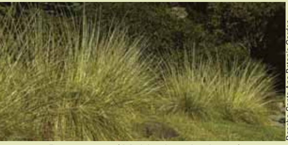
Deer grass (Muhlenbergia rigens)

Three of my favorites are warm season grasses – they grow during the summer and are dormant in winter. Deer grass ( Muhlenbergia rigens ), three foot tall and wide, has bright green blades with long, thin graceful flowering stems that sway in the breeze. Prairie dropseed ( Sporobolus airoides ), similar in size and texture to deer grass, has delicate, open, airy seed heads. Purple three-awn ( Artistida purpurea ), is slightly smaller, with an abundance of purplish fine, sharp awns that fade to a tawny gold. All three have low water requirements and can accept full sun to part shade.