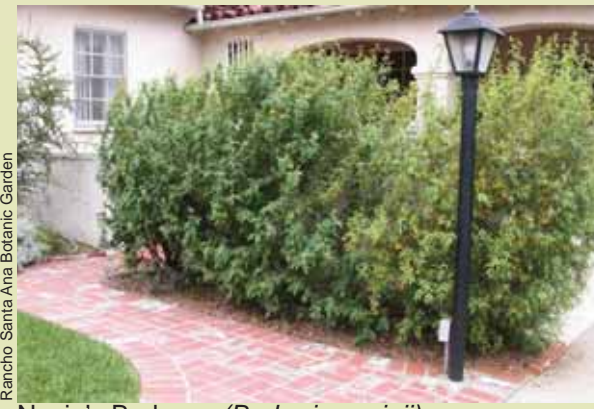
Nevin's Barberry (Berberis nevinii)

Our native flora is well known for a diverse wealth of plants suitable for California gardens. A collection of choices can be suggested to satisfy most any requirement a gardener may encounter - grasses and sedges for a meadow, a low growing manzanita as a bank cover, or a collection of dudleyas in containers. In the urban and suburban environments of California the need for privacy is often a priority, and here too plentiful native choices are available to create living fences.